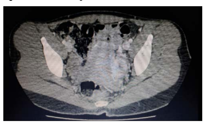
Figure 2 Left ovarian enlargement due to a multilobar formation.

of ovarian origin. Laparoscopic surgical removal of the tumor lesion was proposed, which was performed on March 22, 2019. Intraoperative findings included a regularly enlarged left ovary; the other intrapelvic organs were preserved. Laparoscopic lumpectomy was performed with preservation of the remaining ovarian tissue. A sample of peritoneal fluid was taken. The patient's progress was good and she was discharged on the 3<sup>rd</sup> postoperative day. Histology confirmed the diagnosis of a moderately differentiated SLCT with heterologous elements. The abdominal fluid cytology was negative (Figure 3). The first follow-up lab tests a week after surgery gave the following results (Table 1):